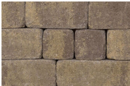
SAND - STONE - MOCHA