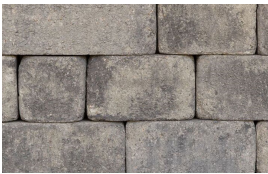
GRAY - CHARCOAL