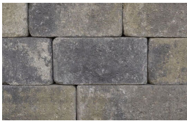
GRAY - MOSS - CHARCOAL