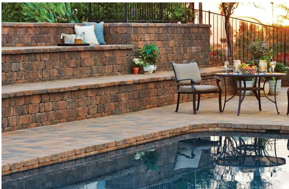
Shown: Cream-Brown-Charcoal Stonewall® II seating wall and pool coping with Cream-Brown-Charcoal Courtyard Stone installed in an ashlar pattern.

Angelus Stonewall® II Olympic Series is a seven-stone package of textured units in warm, earth-toned colors, complemented with the Stonewall® II Caps package. These units offer a versatile medium for creative expression in any landscape design, ideal for seat walls, decorative low-rise walls, low retaining, columns, barbeque enclosures, and more.