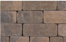
CREAM - BROWN - CHARCOAL

Colors (swatches shown in Stonewall® II)