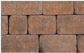
CREAM - TERRACOTTA - BROWN