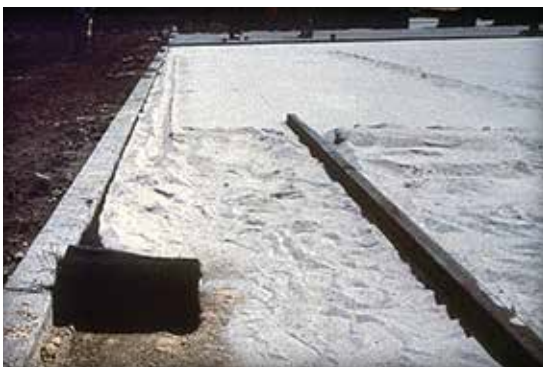
Figure 7. Woven geotextile used to contain bedding sand from migrating laterally. Visit www.icpi.org for detail drawings.

Interlocking concrete pavements should also be designed and constructed such that the bedding sand should not be able to migrate into the base, or laterally through the edge restraints. Dense-graded base aggregates with 5% to 12% fines (the amount passing the No. 200 or 0.075 mm sieve), will ensure that the bedding sand does not migrate down into the base surface. For pavements built over asphalt or con-