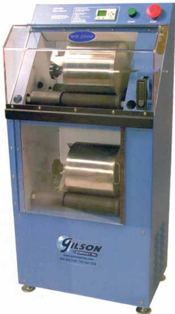
Figure 1. The Micro-Deval test apparatus.

The Micro-Deval test is evolving as the test method of choice for evaluating durability of aggregates in North America. Defined by CSA A23.2-23A, The Resistance of Fine Aggregate to Degradation by Abrasion in the Micro-Deval Apparatus (CSA 2004) and ASTM D 7428-08 Standard Test Method for Resistance of Fine Aggregate to Degradation by Abrasion in the Micro-Deval Apparatus , the test method involves subjecting aggregates to abrasive action from steel balls in a laboratory rolling jar mill. In the CSA test method a 1.1 lb (500 g) representative sample is obtained after washing to remove the No. 200 (0.080 mm) material. The sample is saturated for 24 hours and placed in the Micro-Deval stainless steel jar with 2.75 lb (1250 g) of steel balls and 750 mL of tap water (See Figure 1). The jar is rotated at 100 rotations per minute for 15 minutes. The sand is separated from the steel balls over a sieve and the sample of sand is then washed over an 80 micron (No. 200) sieve. The material retained on the 80 micron