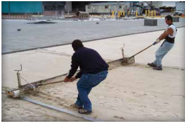
Figure 4. A two-man hand pulled screed