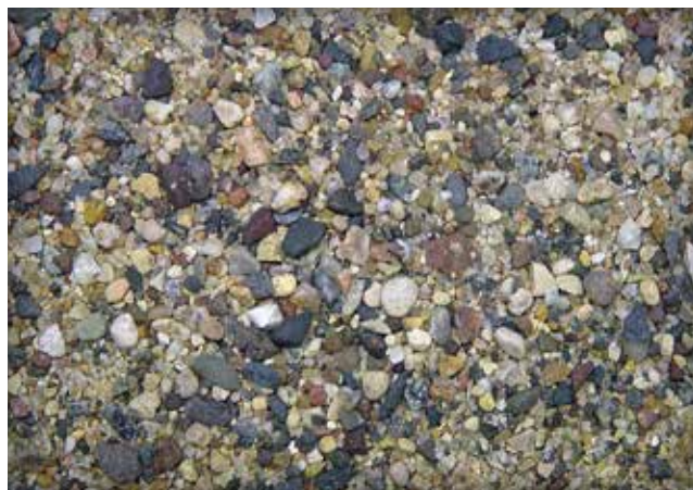
Figure 3. Example of sand from the ICPI bedding sand test program with a total combined percentage of sub-angular and sub-rounded particles equal to 65% according to ASTM D2488

Recommended Material Properties —Table 3 lists the primary and secondary material properties that should be considered when selecting bedding sands for vehicular applications. Bedding sands may exceed the gradation requirement for the maximum amount passing the No. 200 (0.075 mm) sieve as long as the sand meets degradation and permeability recommendations in Table 3. Micro-Deval degradation testing can be replaced with sodium sulfate or magnesium soundness testing as long as this test is accompanied by the other primary material property tests listed in Table 3. Other material properties listed, such as petrography and angularity testing are at the discretion of the specifier and may offer additional insight into bedding sand performance.