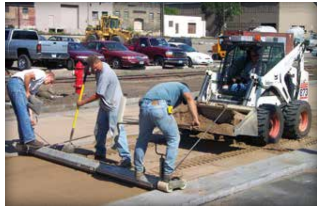
Figure 5. Mechanical screeding is the most efficient method of bedding sand installation

Role of Bedding Sand in Construction —Provided that the base was installed according to recommended construction practices and tolerances (See ICPI Tech Spec 2—Construction of Interlocking Concrete Pavements ), the bedding sand ensures that the pavers have a uniform slope and meet surface tolerances without surface undulations or “waviness.”