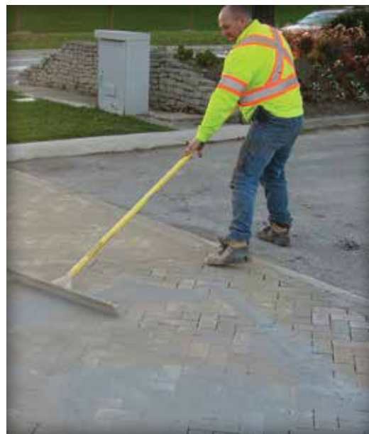
Figure 11. Sweeping in joint sand

The hot bitumen-sand bedding layer is placed, screeded to about \frac{3}{4} in. (20 mm) thick and compacted while remaining above 250° F (120° C) (Figures 4 and 5). This layer typically compacts about \frac{1}{8} in. (3 mm). The depth of this layer must be consistent. If the area does not have a curb to support a screed, screed bars are placed directly on the concrete base to guide the screed.