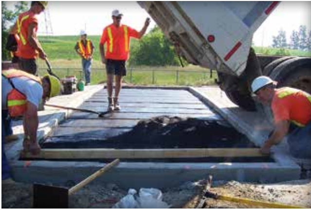
Figure 4. The hot bitumen-sand bedding material is dumped from a truck onto the concrete base.