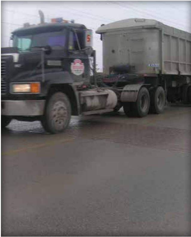
Figure 13. Crosswalk in use under heavy traffic.

ers are in place including cut units, sand is swept into the joints and pavers are compacted until the joints are full (Figures 11 and 12). For more efficient work, sand sweeping and compaction can be simultaneous. Unlike sand-set pavers, there is no need to compact the pavers without sand in the joints first. When completed, the pavement can accept traffic loading immediately (Figure 13).