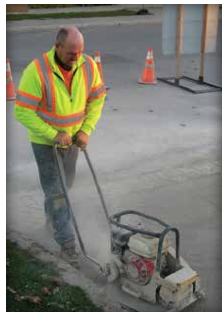
Figure 12. Once the pavers are in place, the joints are filled with dry joint sand and the surface is compacted.

A thin layer of neoprene-asphalt adhesive is then applied with a squeegee to the top of the bedding layer, and allowed to cure (typically 1 to 2 hours). Adhesives with a high viscosity are applied with a straight edged towel as shown in Figure 8. Adhesives with a low viscosity can be applied with a squeegee. The adhesive takes a hazy appearance when ready to mark baselines and place the concrete pavers (Figure 9). Only enough adhesive should be applied that will be covered with pavers in a day's work. Figure 10 shows the paver installation. Once the pavers are placed on the adhesive, they are very difficult to remove. If removed, they can pull up the adhesive and bitumen-sand bedding under the paver. Once all the pav-