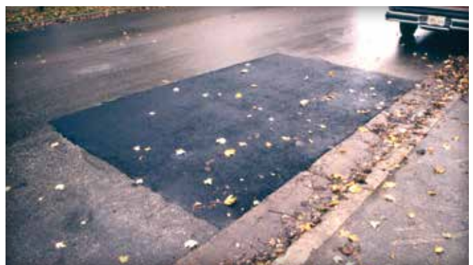
Figure 7. Pavement damage from settlement and shrinkage of cold patch asphalt.

Figures 2, 3, 4, 5 and 6 show the process of repair and illustrate the continuity of the paver surface after it is completed. The