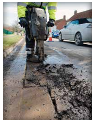
Figure 1. Repairs to utilities are a common sight in cities, incurring costs to cities and taxpayers.

The report concludes that while San Francisco has some of the highest standards for trench restoration, utility cuts produce damage that extends beyond the immediate trench. "...even the highest restoration standards do not remedy all the damage. Utility cuts cause the soil around the cut to be disturbed, cause the backfilled soil to be compacted to a different degree than the soil around the cut, and produce discontinuities in the soil and wearing