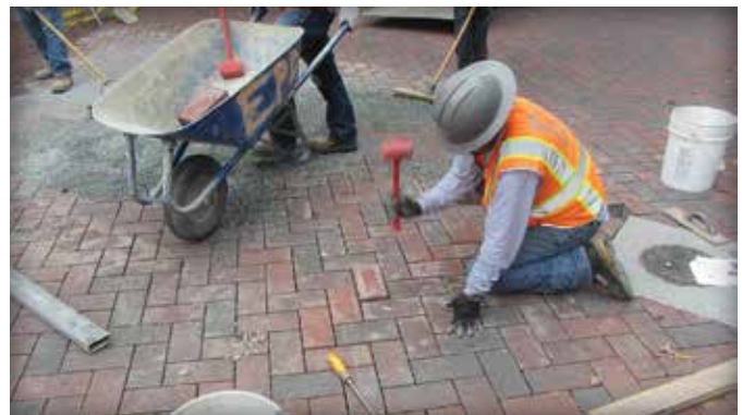
Figure 5. The final paver is inserted, the reinstated area compacted, joints filled, and compacted again. There are not cuts or damage to the pavement surface.