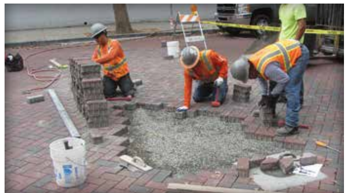
Figure 3. Once smoothed and joined with undisturbed materials at the opening perimeter, the bedding receives concrete pavers.