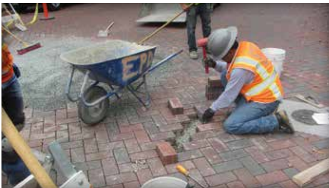
Figure 4. Reinstatement using the same pavers continues following the existing herringbone paving pattern.