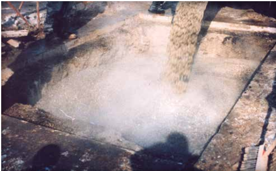
Figure 8. Low density concrete fill (unshrinkable fill) poured into a utility trench from a ready-mix concrete truck.

reinstated units are knitted into existing ones through the interlocking paving pattern and sand filled joints. Besides providing a pavement surface without cuts, the joints distribute loads by shear transfer. The joints allow minor settlement in the pavers caused by discontinuities in the base or soil without cracking.