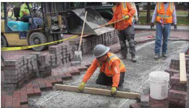
Figure 2. After compaction of the base, bedding material is screeded.

Pavement damage fees may be necessary for conventional, monolithic pavements (asphalt and cast-in-place concrete) be-