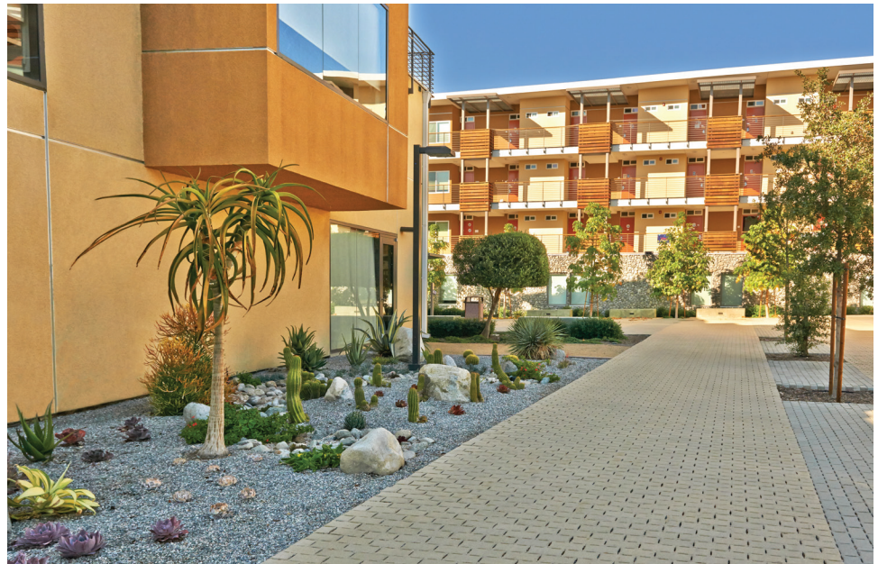
Shown: Sand and Moss Permeable Holland installed in a running bond pattern.