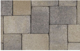
GRAY – MOSS – CHARCOAL

Blended Colors (swatches shown in Antique Cobble I)