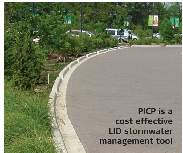
Permeable interlocking concrete pavement (PICP) with open-graded base and subbase for infiltration and storage.

PICP is a cost effective LID stormwater management tool