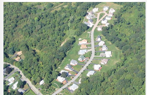
By eliminating detention ponds, the subdivision layout conserves trees while 15,000 sf (1500 m 2 ) of PICP in the cul-de-sac returns rainfall to the water table in Glen Brook Green subdivision in Waterford, CT.