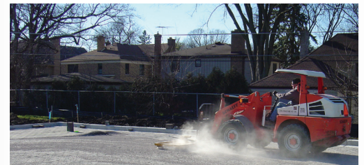
Mechanical sweeping of fine aggregate into paver joints