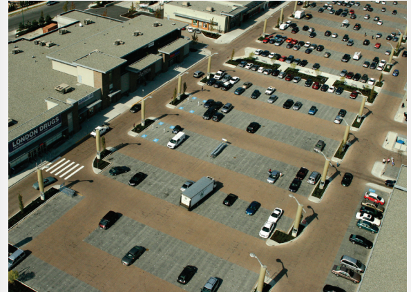
350,000 sf (3.2 ha) of PICP at a Burnaby, BC shopping center infiltrates runoff from roofs.