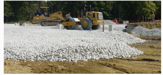
Base construction uses locally available materials.