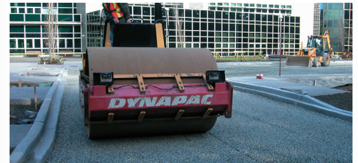
Aggregate base and subbase are spread and compacted; pavers are delivered ready to install. After placement, joints and/or openings are filled with small aggregate. Then pavers are compacted.